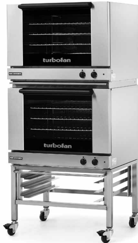
Model E28M4/2C shown